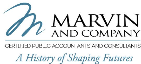
Marvin and Company | Eagle Sponsor