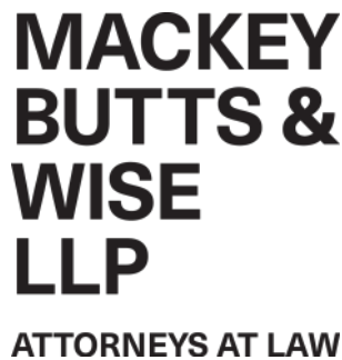
Mackey, Butts & Wise, LLP | Power Card Sponsor