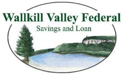
Wallkill Valley Federal Savings and Loan | Power Foursome