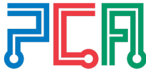
Professional Computer Associates | Mystery Gift Sponsor