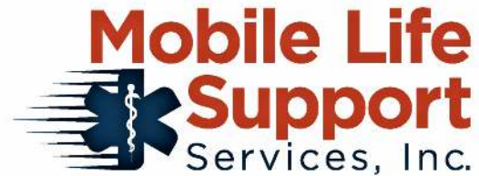
Mobile Life Support Services, Inc. | Eagle Sponsor