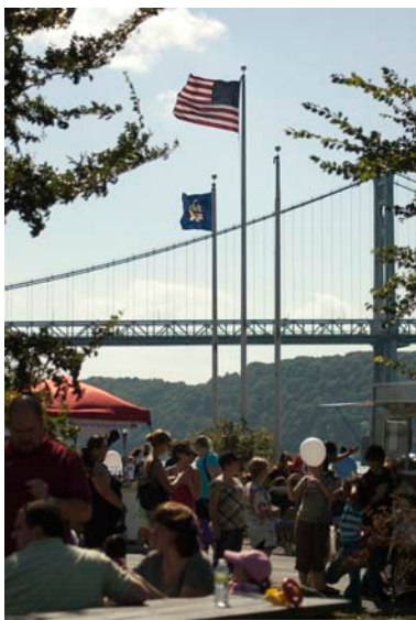
Perfect weather and a new location along the Hudson River drew lots of families to Kids Expo 2010.