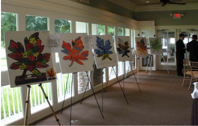
A few of the artists' submissions for the Leaf A Legacy Campaign