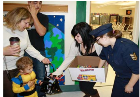
It was a happy Halloween for kids of all ages and abilities!

Each year, neighbors in the building shared with our Abilities First Preschool at Myers Corners look forward to greeting our trick or treaters as much as our Preschoolers enjoy being on the receiving end of this activity! Students in Orchard View High School, office staff from Wappingers Falls School District Administrative Offices, and – joining in for the first time this year – Laerdal Medical Corp., all got caught up in the spirit of the holiday and handed out candy to our Preschoolers in costume.