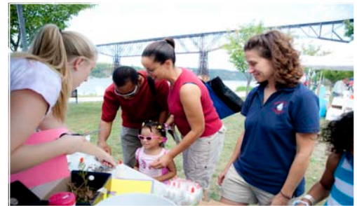
Fun and educational activities are the highlight of the event.

Mark your calendars for Kids Expo 2011 that will take place on September 10th and 11th!