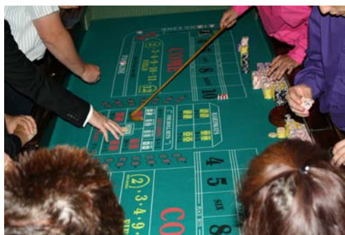
The big winner - Abilities First!