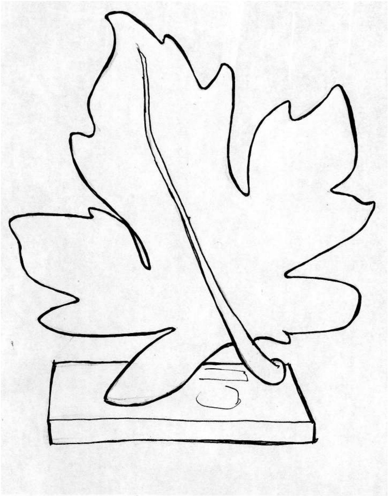
Maple Leaf Rear